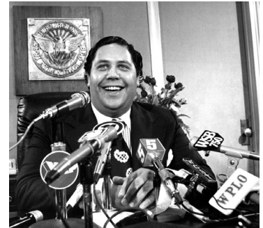
Mayor Maynard Jackson Jr.