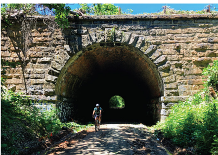
Above: Southside Interim Trail tunnel under Hank Aaron Dr./McDonough Blvd.