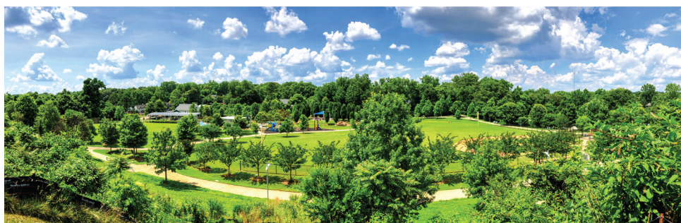
Cover: Eastside Trail from the N. Highland Ave. bridge hours before Lantern Parade 2018. Opposite Page: Southside Interim Trail east of Boulevard. Above: D.H. Stanton Park viewed from the Southside Interim Trail.