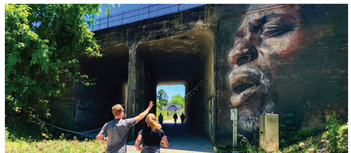
Top of Page: Diners enjoy Lean Draft House in Southwest Atlanta. Above: Westside Trail tunnel under Ralph David Abernathy, Jr. Blvd.

The Southside Trail runs east, adjacent to the former Pittsburgh Yards, which is expected to be a vibrant, living-wage job ecosystem that clusters a range of businesses together, including industrial, office and administrative, artistic and creative enterprises. Plans also continue for Murphy Crossing on the Westside Trail, an ambitious mixed-use development and greenspace planned for the former site of the state farmer's market.