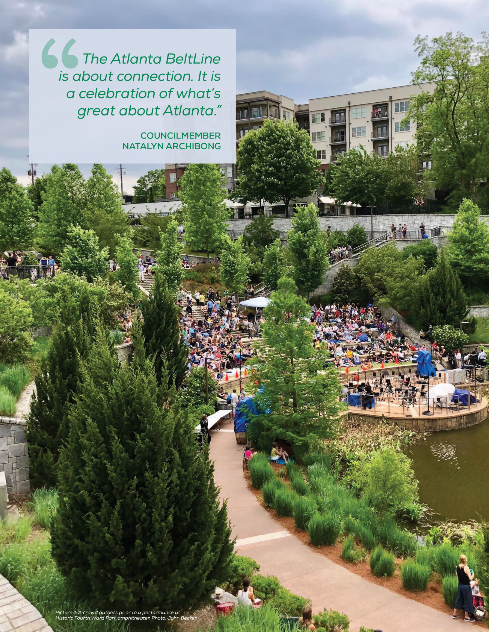
Pictured: A crowd gathers prior to a performance at Historic Fourth Ward Park amphitheater.