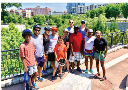
Above: Free bike tour participants visit Historic Fourth Ward Park.