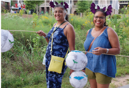
Above: Drawing 70,000+ participants in 2018, the Eastside Trail's Lantern Parade is one of Atlanta's iconic fall events.