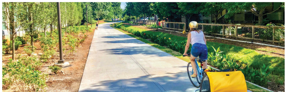
Above: Eastside Trail north of Memorial Dr.