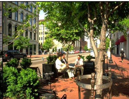
Streetscapes and Transportation Infrastructure