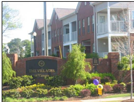
Workforce Housing $240M ~5,600 units