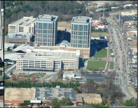
Jobs and Econ. Development 20 areas, 30k jobs