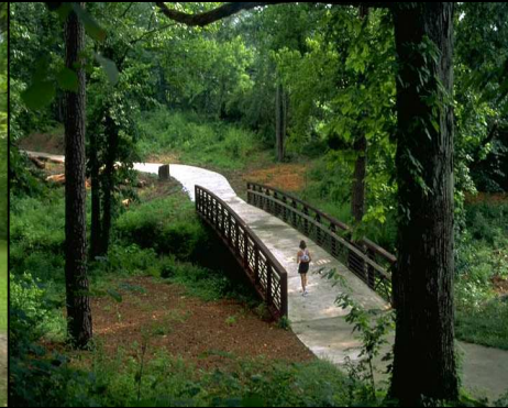
Trails 33 miles