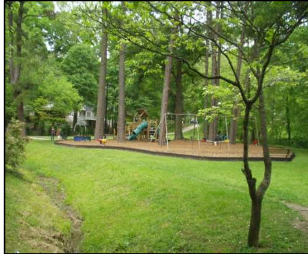
Parks ~ 1300 new acres