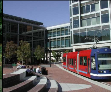
Transit 22 mile loop