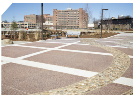
Pictured Left: The newest section of the park includes lawns and hardscapes, creating a beautiful front entrance to the park from North Avenue.

While the bulk of Historic Fourth Ward Park opened in the spring of 2011, the stretch of park that extends to North Avenue was completed in January 2012. This outstanding park has even more amenities now, and we encourage you to get out and enjoy it with your friends and family!