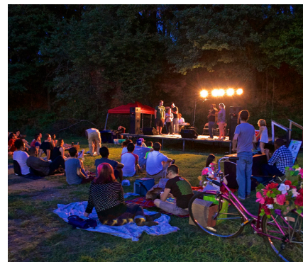
Dad's Garage performing at the temporary stage in Reynoldstown for Art on the Atlanta BeltLine.