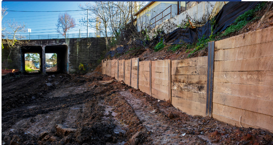
Westside Trail construction progress near the bridge at Ralph David Abernathy.

A little more than one year ago, the Atlanta BeltLine broke ground on the Westside Trail! Though the weather has been uncooperative at times, we are really excited about the progress we've made since that groundbreaking. From pile-driving to potholing, the beginning infrastructure has been laid for the $43 million trail in southwest Atlanta. With several retaining walls being built and shoring and backfilling in process, the trail's form is beginning to take shape. Construction is expected to be complete in 2017. When finished, the Westside Trail will be a 3-mile multi-use corridor that features a concrete trail and can accommodate future transit. Fourteen access points are being built with the trail (11 of which are ADA-accessible),