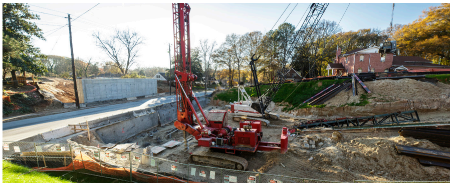
A view of construction progress at Martin Luther King, Jr. Drive.