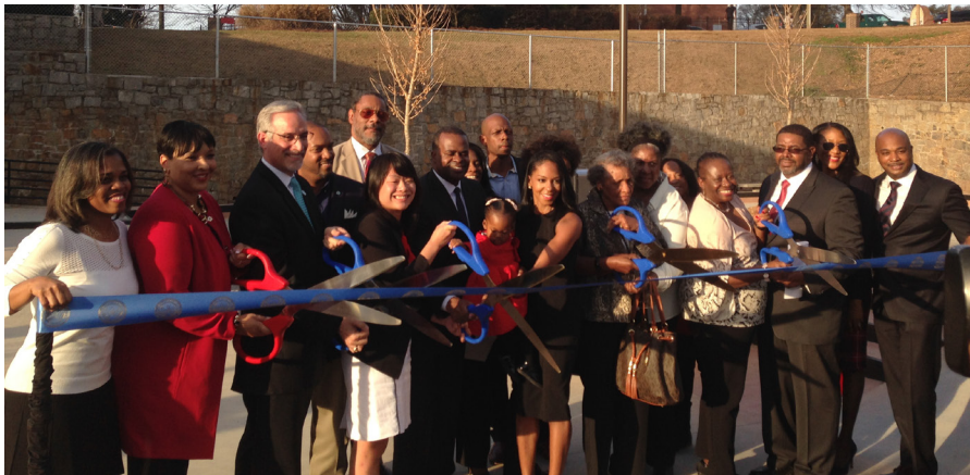
Ribbon-cutting at Arthur Langford, Jr. Skatepark in December 2015.

to provide safe places for community members to come together, the City of Atlanta and the Department of Parks and Recreation, along with their other partners, are revitalizing outdoor spaces with an emphasis on city parks. ABI managed the park's construction, while the Coca-Cola Company played a key role in helping fund the skatepark along with providing a mural. Coca-Cola will also be funding skate clinics through a Park Pride grant. Once the Atlanta BeltLine is complete, there will be direct access to the skate park from the trail.