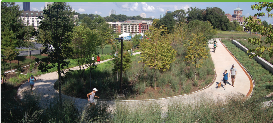
The Eastside Trail Gateway connecting Historic Fourth Ward Park to the 2-mile trail.

On a warm Autumn day, a crowd of 200 gathered in Historic Fourth Ward Park to celebrate the opening of the Gateway Trail. Though one of