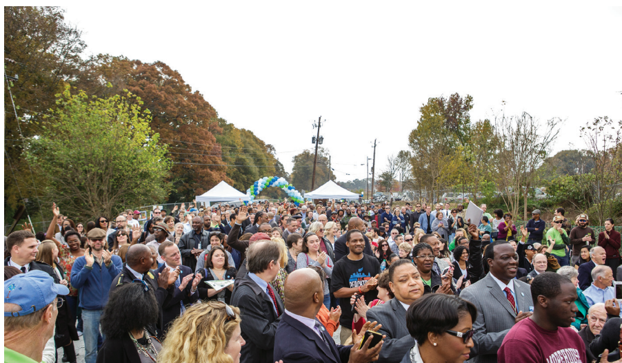
A crowd of more than 500 showed their support for this next major segment.

Stay up-to-date on construction progress at beltline.org/westsidetrail .