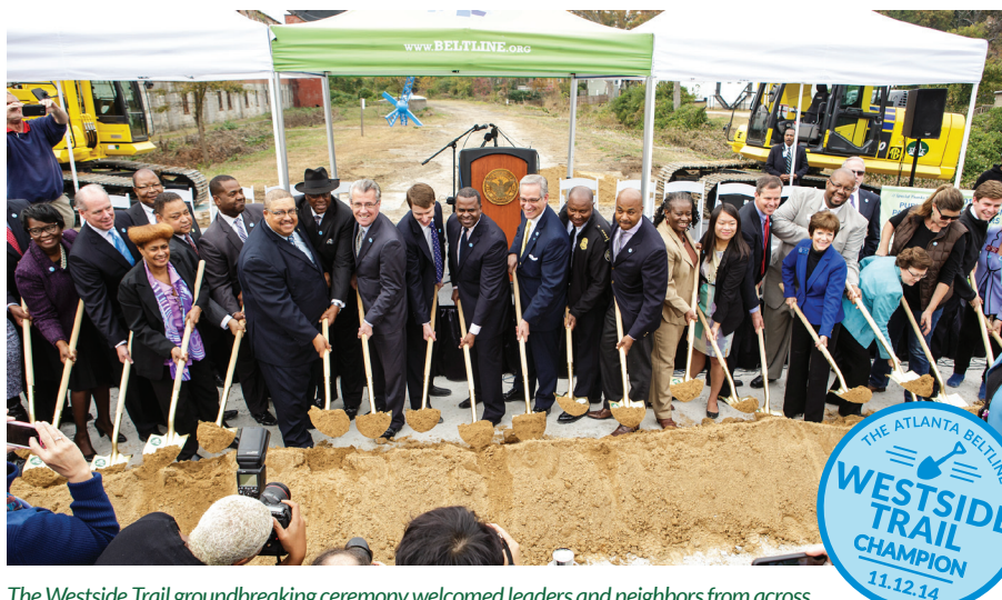
The Westside Trail groundbreaking ceremony welcomed leaders and neighbors from across the city with speeches and the ceremonial tossing of dirt.

Spotted around town: Atlanta BeltLine Partnership's new tour bus! With the purchase of a natural gas-powered tour bus, the Atlanta BeltLine Partnership's tour program will become both more environmentally and economically sustainable and handicapped accessible. Since its launch in 2007, the Atlanta BeltLine Bus Tour program has provided free, three-hour tours of the Atlanta BeltLine to more than 20,000 individuals and organizations. For more info, visit www.beltline.org/tours .