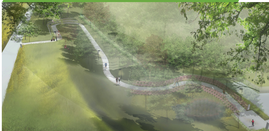
The Gateway, shown in this rendering, will wind down the hill near the Angier Springs access point of the Eastside Trail to Historic Fourth Ward Park.

Construction on a connection between the Eastside Trail and Historic Fourth Ward Park is expected to begin by the end of 2013. The path, known as the Gateway, is an ADA-accessible trail that will begin across from the Angier Springs Road access point of the Eastside Trail, and wind down the hill toward the park, connecting at Dallas Street and North Angier Avenue. The design includes landscaping, retaining walls, lighting, and green infrastructure stormwater design. Historic Fourth Ward Park features a stormwater detention basin that doubles as a two-acre lake, a design feature that serves both a functional and aesthetic purpose. The Gateway will connect the park directly to the 2-mile paved portion of the Eastside Trail, running from Inman Park to Piedmont Park.