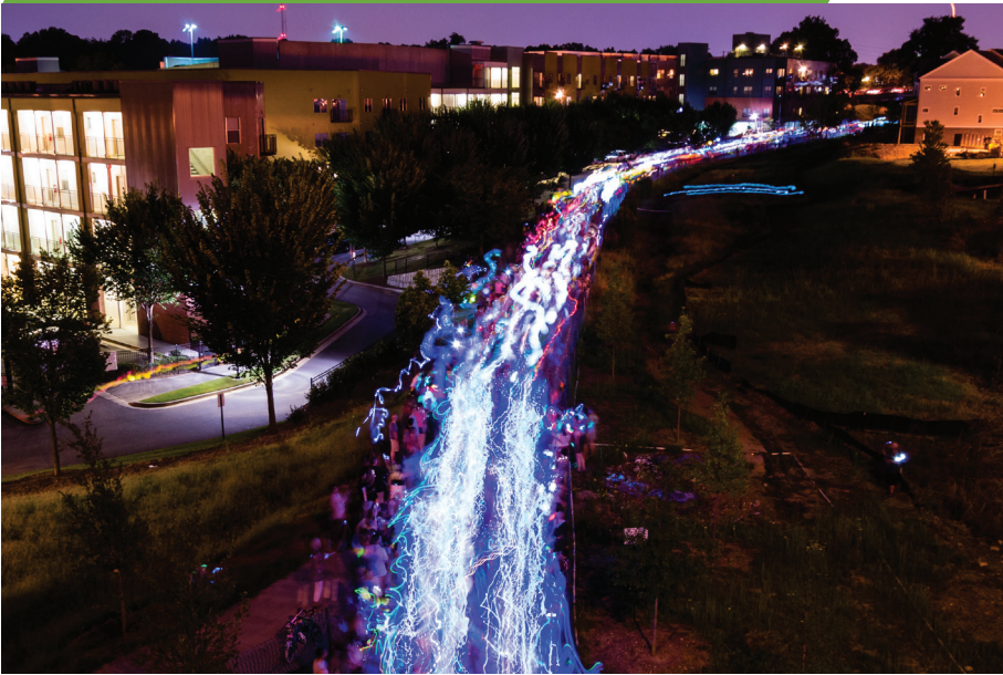
The Atlanta BeltLine Lantern Parade winds under Freedom Parkway on the Eastside Trail with a two-mile stretch of creative lanterns, vibrant lights, and energetic marching bands.