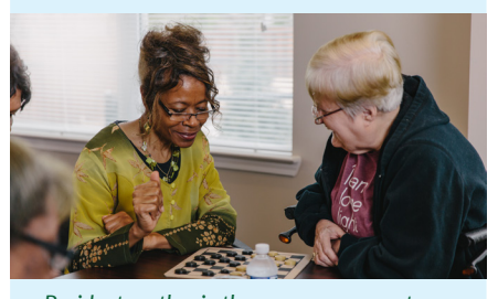
Residents gather in the common areas at Reynoldstown Senior.

New in "Life on the Atlanta BeltLine," we feature a look at the lives of two residents at Reynoldstown Senior. Reynoldstown Senior Residences is an independent-living, affordable senior housing facility servicing residents 62 years and older. The property is located in the heart of the historic Reynoldstown neighborhood which is one block from the future Eastside Trail extension. See the whole video at bit.ly/2p3Lc5h.