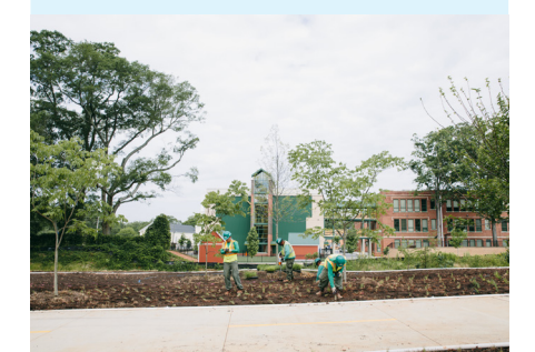
Planting of grass plugs and large trees along Muse Street, across the Westside Trail from KIPP Strive Academy in Westview.

up four more miles of multi-use trails for your enjoyment. The Westside Trail and Eastside Trail Extension are nearing completion—stay tuned for opening dates.