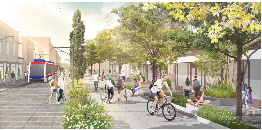
A rendering of potential design of the Atlanta BeltLine along Bill Kennedy Way.

Bill Kennedy Way (BKW), the road that connects Memorial Drive and Glenwood Avenue over I-20 at the Atlanta BeltLine corridor, presents a unique design opportunity of its own. In 2016, community meetings were held to invite input on the trail alignment on BKW. Considering the development at Glenwood Park and traffic exiting I-20, it was determined that the east side of BKW is the best alignment for the trail. Plans are at approximately 25% design, and include the 14-foot trail, transit consideration, and state-of-the-art shared space between Faith Avenue and Glenwood Avenue.