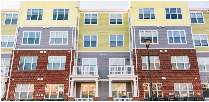
Affordable Reynoldtown Senior Residences.

Since 2006, nearly 11,000 units of housing have been developed in the Atlanta BeltLine Tax Allocation District. Nearly 800 of these units are affordable housing supported by Atlanta BeltLine, Inc. and Invest Atlanta. Over 1,100 affordable units have been created in the Planning Area. Over the next three years, ABI will invest over $18 million to support an additional 425–600 affordable units. More info at beltline.org/housing .