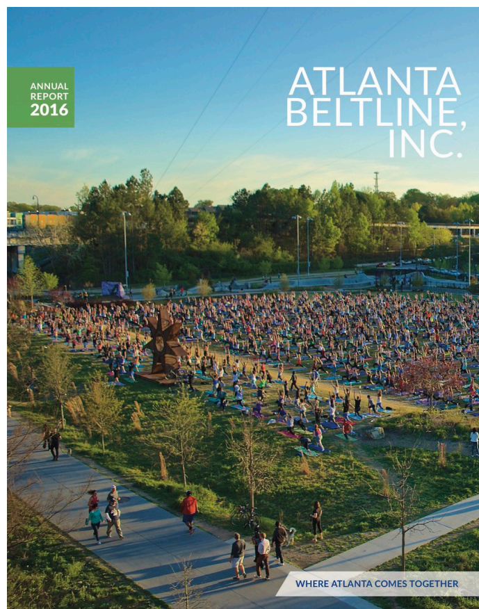
The cover of the 2016 Annual Report shows hundreds of people gathered in Historic Fourth Ward Skatepark for King of Pops yoga.

and nearly all metropolitan areas are experiencing these challenges in their unique environments. As the Atlanta BeltLine progresses, conversations surrounding equity and affordability must continue to take center stage. To download the annual report, visit beltline.org/about/resources/annual-reports .