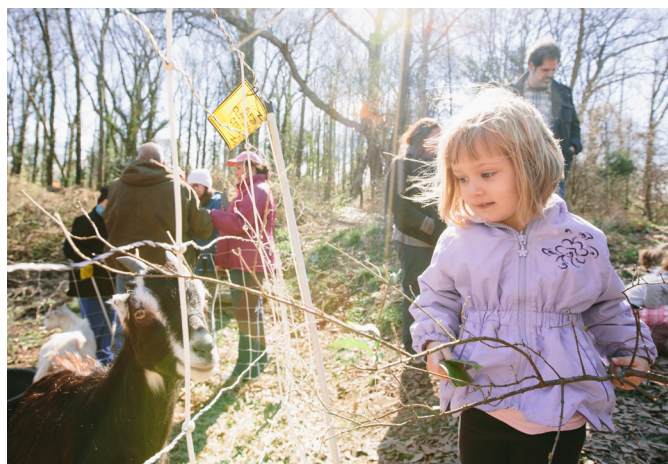
Goats have been used as a natural method of clearing invasives, such as this one in Enota Park.

Other ABP-sponsored events included the Washington Park Jamboree, the Boulevard Crossing Play Day, and the Old Fourth Ward Fall Fest.