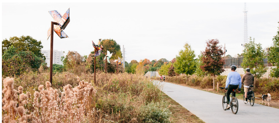
"Whirling Wheels" by Alex Rodriguez on the Eastside Trail.

Four prototype benches, fabricated by both local and national artists and design firms, were installed along the Eastside Trail. The prototypes will be evaluated for durability, functionality, and aesthetics. Benches were designed by Ryerson Design; Gensler; Hill, Foley & Rossi; and OrchestraOne Studio.