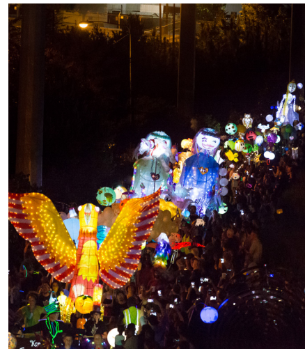
The Atlanta BeltLine Lantern Parade.