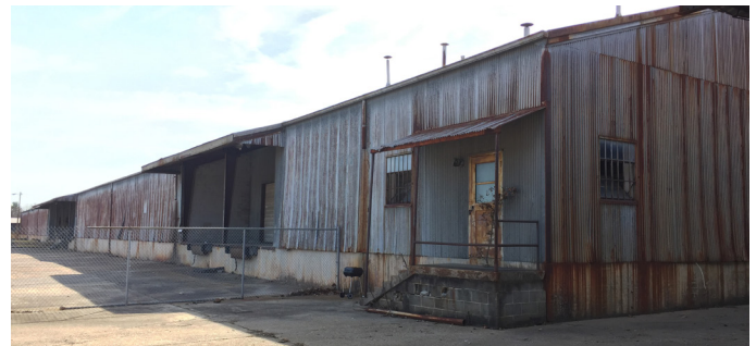
Murphy Crossing provides 16-acres of development potential on the Westside Trail.

In 2016, ABI commenced certain activities related to implementation of the economic development portions of the Integrated Action Plan, including corridor monetization, land optimization and product development, identification of new financial tools, and job creation.