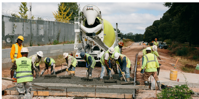
Pouring concrete on the three-mile Westside Trail's southern terminus.

Construction continued in earnest on the 3-mile Westside Trail, with retaining walls, ponds, bridges, and access points coming into focus. Concrete pouring took place just north of Martin Luther King, Jr. Drive to the Lionel Hampton Trail and between University Avenue and Allene Avenue. Crews with Trees Atlanta began planting the large trees that make up the trail's landscaping plan. Completion is scheduled for summer.