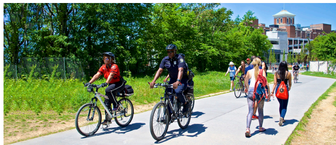
The mobile medics team.

The Atlanta BeltLine's dedicated APD unit, the Path Force, continues to patrol trails, parks, and adjacent neighborhoods. This past summer, Atlanta Fire and Rescue Department introduced Mobile Medics on the Eastside Trail. Both units ensure the safety and security of visitors.