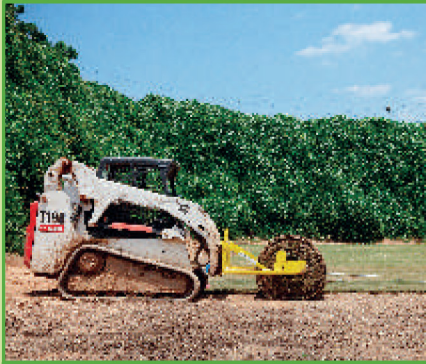
Progress made laying sod for the new ballfields at Boulevard Crossing Park in Southeast Atlanta.

Phase I of Historic Fourth Ward Park in the heart of the Old Fourth Ward neighborhood is rapidly approaching completion. This is just one of several projects currently underway that Atlanta residents will soon be able to enjoy.