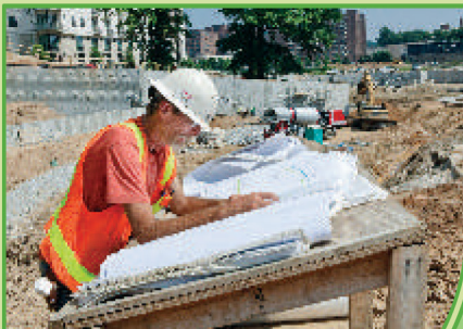
Construction crews reviewing plans and making significant progress in Historic Fourth Ward Park.

There will be a series of grand openings for these new projects throughout 2011.