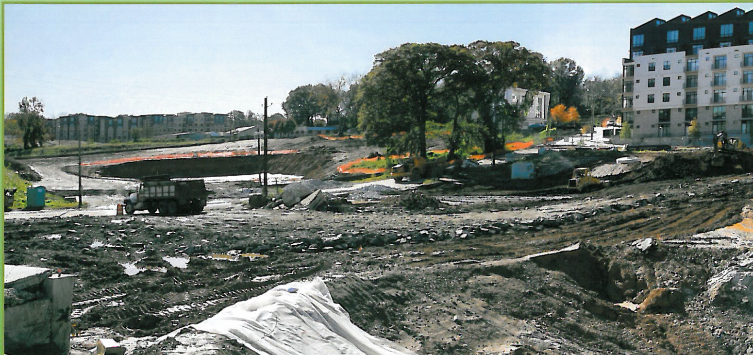
Construction of Historic Fourth Ward Park November 2009