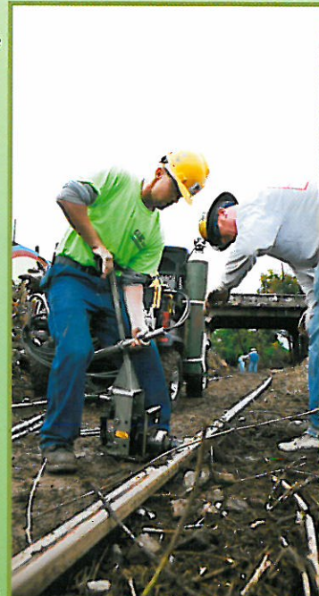
Workers removing the old rails in the BeltLine Northeast Corridor north of Dekalb Avenue. A hiking trail from Dekalb Ave to Montgomery Ferry Road will be open to the public in early 2010.

In the Southeast, D.H. Stanton Park will break ground in the spring of 2010 and be complete by the fall. It will include an active play space that will provide the community with a plethora of amenities including a pavilion for family gatherings, a little league/softball field funded by the Blank Foundation, a splash pad and restroom facility, a multi-use field, a climbing hill with a fabric shade structure, extensive plantings, expanded play spaces for under 5 and 5-10 year olds, and a new direct connection from the Grant Way neighborhood.