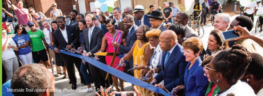
Westside Trail ribbon cutting.