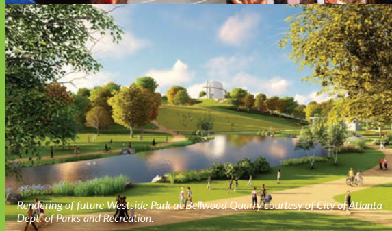
Rendering of future Westside Park at Bellwood Quarry courtesy of City of Atlanta Dept. of Parks and Recreation.