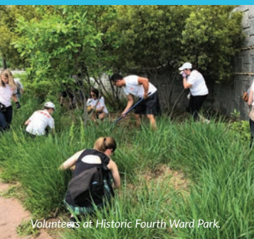
Volunteers at Historic Fourth Ward Park.

The Atlanta BeltLine represents a new framework for Atlanta's growth, centered on Transit Oriented Development, expansion of park land and public spaces, and vital expansion of the regional transit and transportation network.