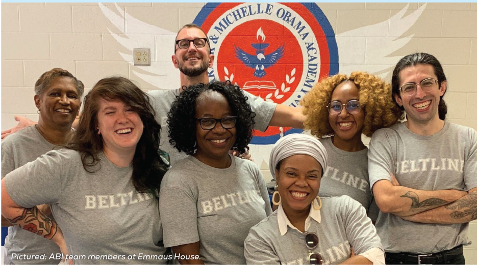
Pictured: ABI team members at Emmaus House.

Visit beltline.org/beltlineconnections to read the full article!