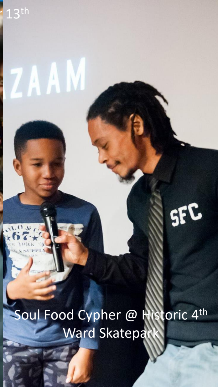
Soul Food Cypher @ Historic 4 th Ward Skatepark