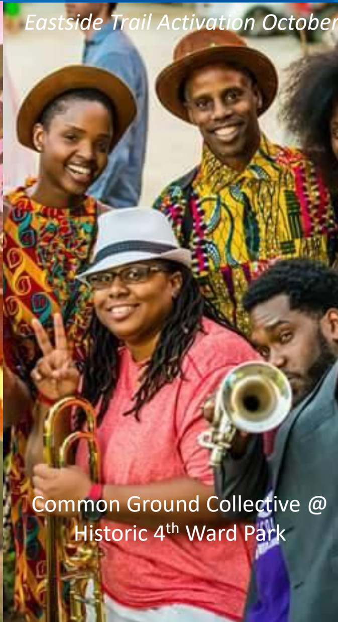
Eastside Trail Activation October 13 th