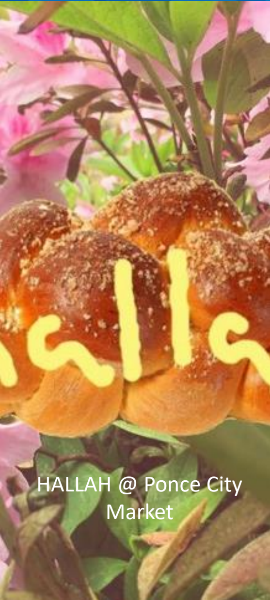
HALLAH @ Ponce City Market