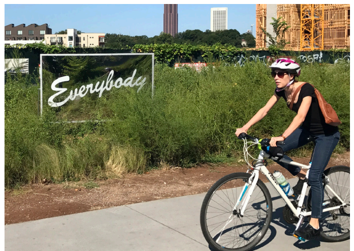
Everybody's Painting's mirrored sculpture; Photo by everybodypainting

New solutions to address affordability challenges across the city are urgently needed. AoAB's vision is for a city in which artists and cultural workers are helped to live and work without being displaced and without displacing vulnerable residents.