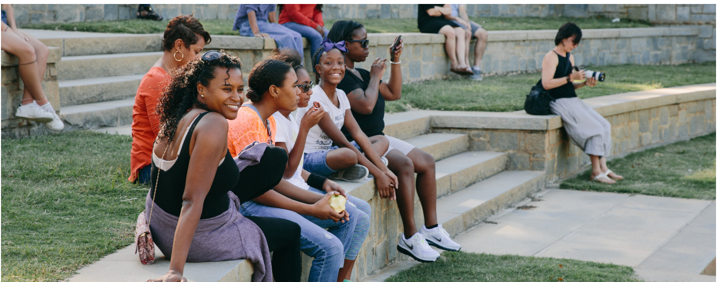
Audience at Art on the Atlanta BeltLine performance in 2016

Improving access means reducing economic, social, communication, and physical barriers to inclusive participation. Accessibility describes the degree to which an environment, service, product, or program allows access and eliminates barriers to participation by diverse or underrepresented communities, especially people with disabilities.