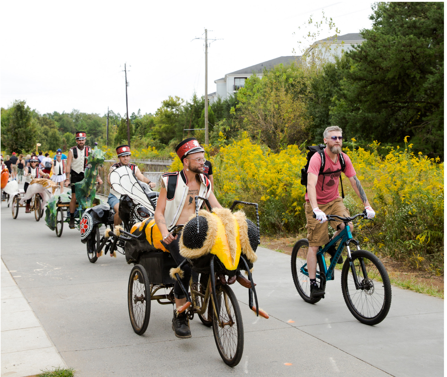
KOLOSSES parade on Eastside Trail; Photo by The Sintoses

Perhaps most importantly, AoAB affirms our BeltLine is our public commons: vital places to come together, express our diverse cultures, and engage in free speech. In doing so, AoAB maps a vision for the future of Atlanta that celebrates the voices, experiences, and values of all Atlantans.