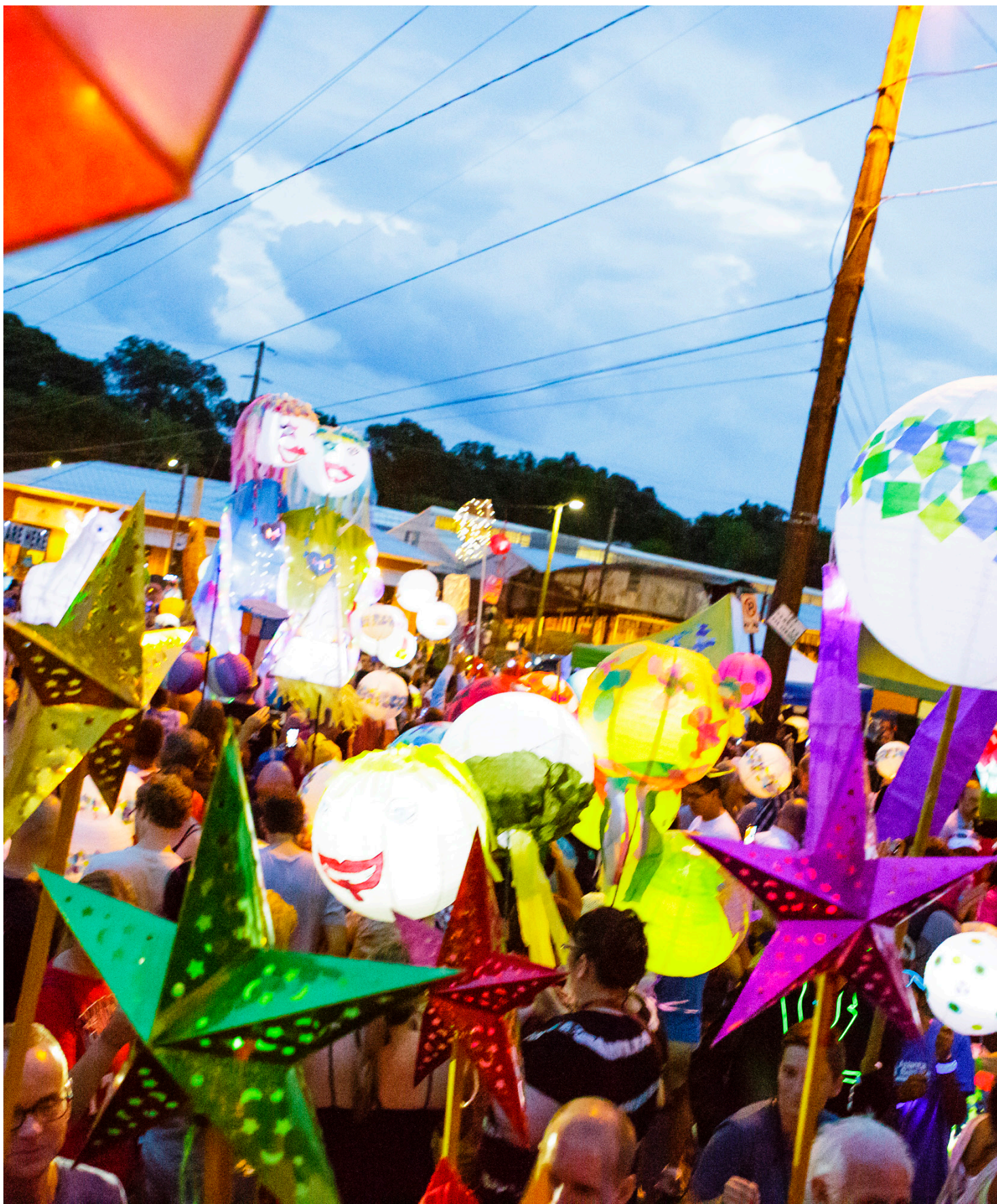
The Lantern Parade. Signature event kicking off Art on the Atlanta BeltLine