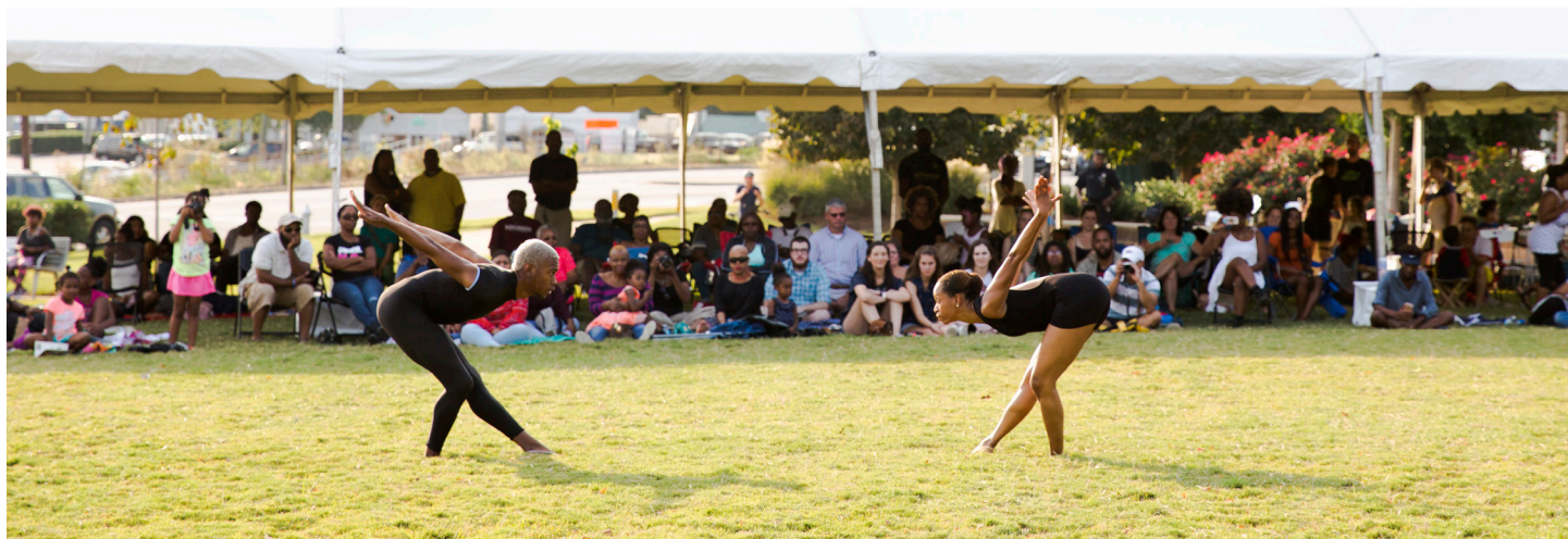
City Gate Dance Theatre performs Beau-e-tudes at Gordon White Park

A 2016 ArtPlace America analysis, entitled Exploring the Ways Arts and Culture Intersects with Housing: Emerging Practices and Implications for Further Action , provided examples of community-based groups nationwide, finding that arts-based strategies were crucial in their efforts to stabilize vulnerable communities. These institutions and groups are uniquely capable of reflecting the character of the neighborhoods which they inhabit and intimately understanding what their communities need. These local organizations face the same pressures as those felt across their neighborhoods. A strategy for supporting these community anchors should not only support and preserve what is there, but also expand on it, especially in communities of historic under investment.