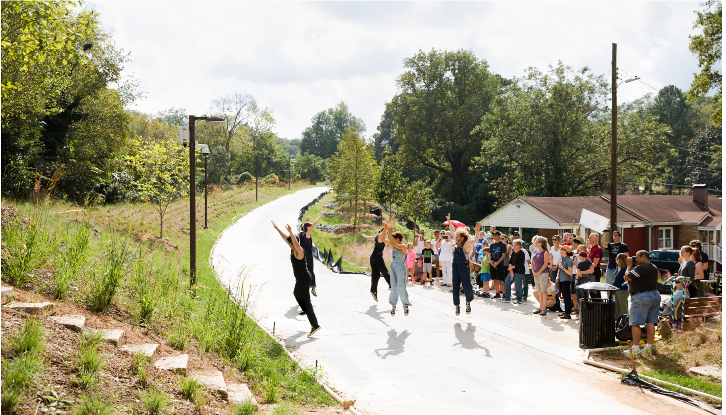
Crossover Movement Arts, In the Valley of the Whirlygigs

The Atlanta BeltLine is the most comprehensive transportation and economic development effort ever undertaken in the City of Atlanta and among the largest, most wide-ranging urban redevelopment programs currently underway in the United States. The Atlanta BeltLine is a sustainable redevelopment project that is transforming the city. It will ultimately connect 45 in-town neighborhoods via a 22-mile loop of multi-use trails, modern streetcar, and parks – all based on railroad corridors that formerly encircled Atlanta. When completed, it will provide first and last mile connectivity for regional transportation initiatives and put Atlanta on a path to 21st century economic growth and sustainability.