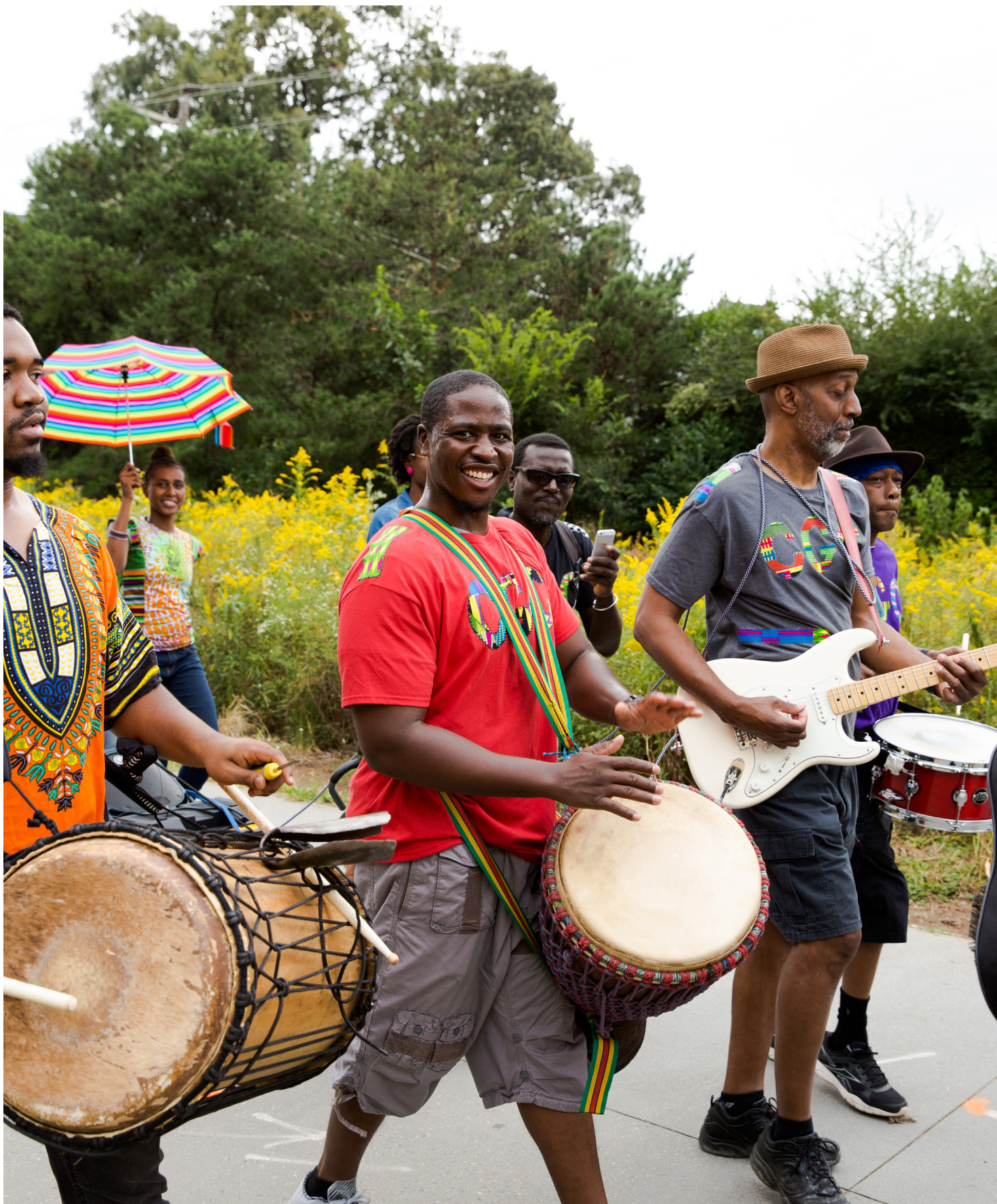
Art on the Atlanta BeltLine Performance; Photo by the Sintoses.