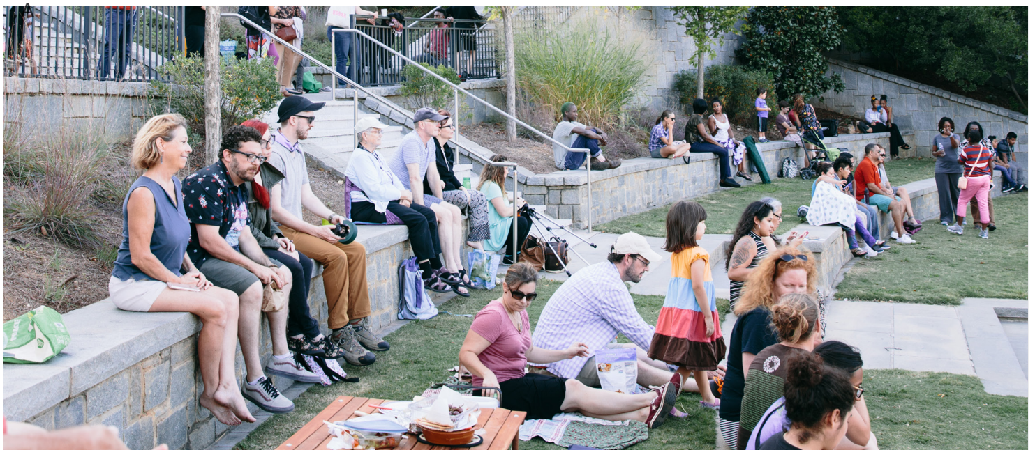
AoAB performances in Historic Fourth Ward Park; Photo by The Sintoses.