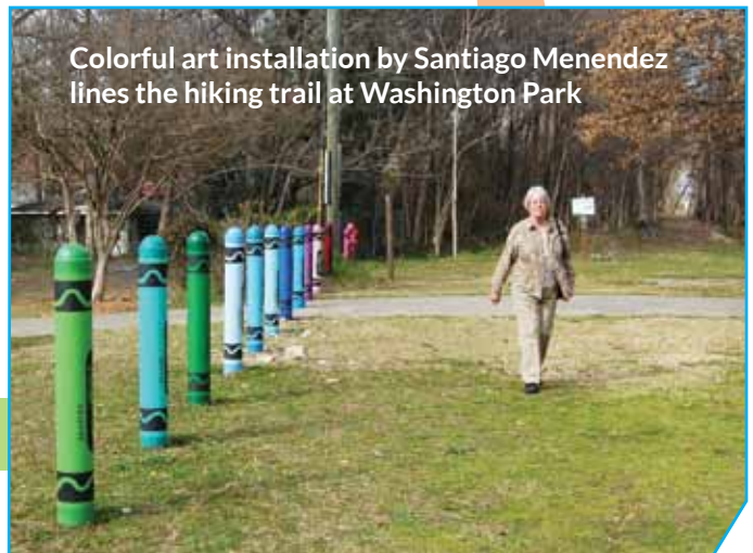
Colorful art installation by Santiago Menendez lines the hiking trail at Washington Park