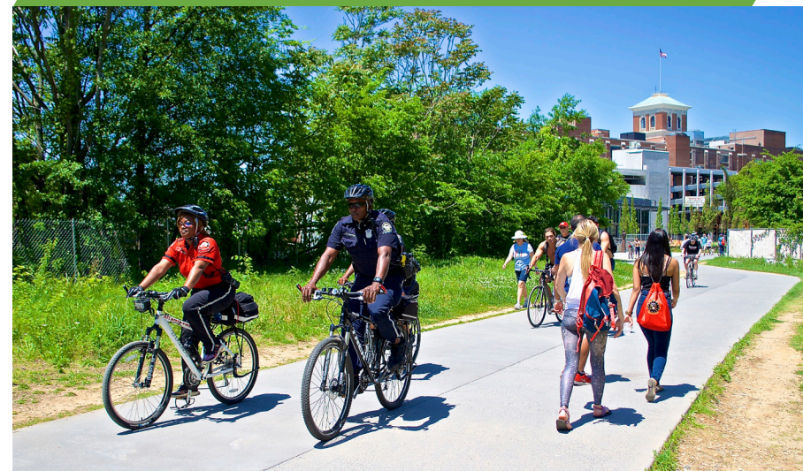
Keep an eye out for Mobile Medics, now patrolling the Eastside Trail!

Firefighters from Atlanta Fire and Rescue Department's Mobile Medics Bike Team recently joined the Atlanta Police Department's Path Force Unit out on the Eastside Trail. These firefighters are specially trained and equipped EMT's and paramedics who are able to respond to medical emergencies. Mobile Medics and the Path Force will now work together to ensure the safety and security of visitors to the Atlanta BeltLine. For now, the Mobile Medics will be patrolling the Eastside Trail on Saturdays and Sundays from 11 a.m. to 6 p.m. Coverage will be extended as trail volume usage increases.