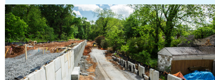
Westside Trail construction north of MLK, Jr. Drive.

In April, we were thrilled to reopen our affordable housing program for the second year. This partnership with Federal Home Loan Bank of Atlanta positively impacted nearly two dozen homeowners last year and we look forward to a larger program in 2016.