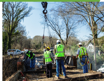
Astra Group removing the bridge over Martin Luther King, Jr. Drive in March.

Astra Group, the company constructing the Westside Trail, has hired a total of five Westside Works graduates. Hiring within the community means that the workers take a greater sense