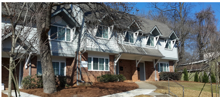
Stanton Oaks, formerly Boynton Village Apartments, are undergoing complete renovations in Peoplestown, adjacent to D.H. Stanton Park and the future Southside Trail.

Atlanta BeltLine Affordable Housing Trust Fund dollars also helped to fund the renovation of Stanton Oaks, formerly Boynton Village, in southeast Atlanta. The 43-unit building received a complete rehabilitation with modern amenities and energy-efficient upgrades. Adjacent to D.H. Stanton Park, Stanton Oaks is on the future Southside Trail of the Atlanta BeltLine, and is intended to serve families that earn less than 50% area median income.