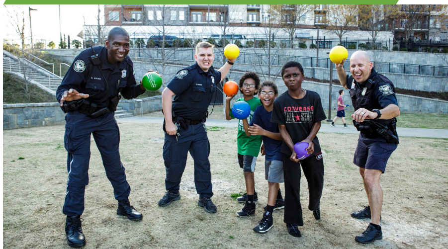
All ages assembled in Historic Fourth Ward Park for the 2015 Fitness Fair, including Path Force Unit officers from the Atlanta BeltLine's dedicated police force.

The Atlanta BeltLine Partnership hosted the first Atlanta BeltLine Fitness Fair on Tuesday, March 24 at Historic Fourth Ward Park. Hundreds walked, ran, biked or danced their way to sample some of the Partnership's many free fitness classes and activities. Thousands have participated in these free fitness classes, launched in conjunction with dozens of organizations, aimed at getting Atlantans out and moving on the Atlanta BeltLine. The classes support the Partnership's goal of creating healthier communities throughout the city.