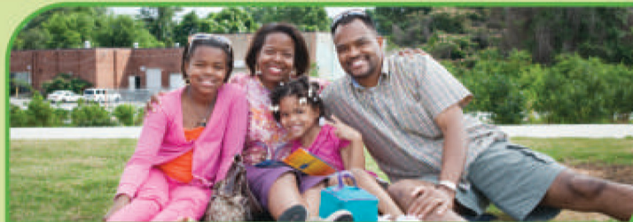
A family enjoys the kickoff event for Art on the BeltLine in Gordon White Park.