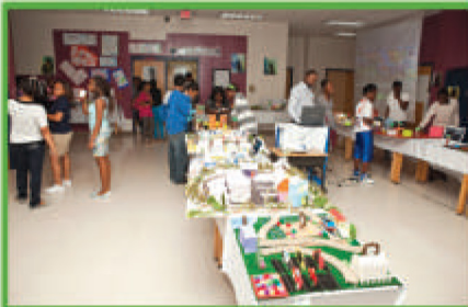
A collection of exhibits created by King Middle School's eighth grade class embodying their visions of the Atlanta BeltLine and how their neighborhoods will evolve throughout the next 30 years.