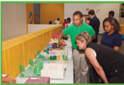
Local community members admiring the work of more than 200 King Middle School students' custom curriculum projects that tie in the Atlanta BeltLine and its potential positive impact on their neighborhoods.