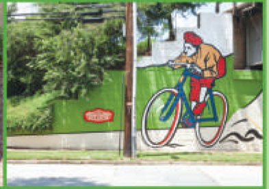
The Loss Prevention Collective (untitled)