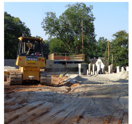
Backfilling the retaining walls, paving the new bridge, and constructing the ramps and stairs alongside Martin Luther King, Jr. Drive.

For more updates and photos, please visit beltline.org/westsidetrail .