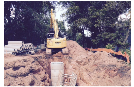
Installation of ductwork between Wylie Street and Kirkwood Avenue.

Kirkwood Avenue closed temporarily for placement of a speed table. It has reopened. Wylie Street experienced rolling single-lane closures for utility relocation. Design for this Wylie Street area calls for a 10-foot multi-use trail on the north side of the road, buffered from traffic by landscaping. On the south side, on-street parking will be preserved where it is presently available, and new crosswalks will accompany sidewalks for pedestrians. Bicycles traveling in either direction can choose to utilize the trail