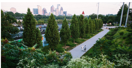
Pictured above is the cover photo for the online version of the New York Times article.