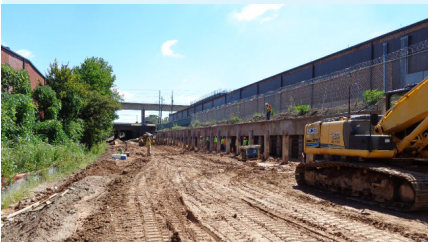
Westside Trail construction looking east towards Lee Street and Murphy Avenue.

Between building the Westside Trail and Eastside Trail Extension, designing the Southside Trail, planning for transit along the Atlanta Streetcar System Plan, and pursuing affordable workforce housing across the Atlanta BeltLine Planning Area, the staff at Atlanta BeltLine, Inc. is hard at work in multiple sections of the city.