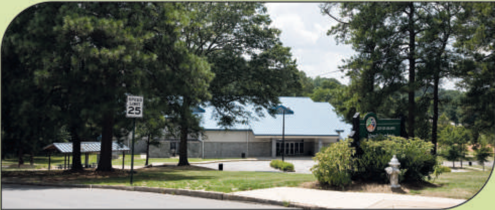
Washington Park, one of the landmarks along the Southwest BeltLine corridor. ABI recently secured an option and lease on this corridor from the Georgia Department of Transportation.

sign up for a tour of the corridor (including these newly-acquired sections), and participate in the planning of the BeltLine, please visit www.BeltLine.org .