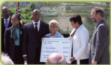
On June 2, U.S. Environmental Protection Administrator Lisa Jackson presented the City of Atlanta with a $1 million grant for the purpose of cleaning brownfields. Areas on the BeltLine are eligible for this funding.