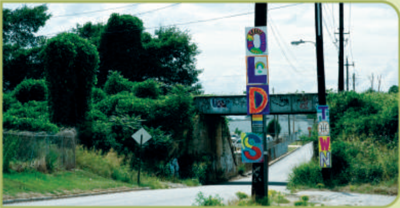
The BeltLine bridge over Fulton Street in Reynoldstown, one of the recently secured sections of the BeltLine. In July, ABI entered an option agreement and secured a lease on this corridor from the Georgia Department of Transportation. Local residents and artists recently put art and signs along the BeltLine Corridor, shown here, where the route will run.

Atlanta BeltLine, Inc. is preparing to return to the bond market later this year to secure more funding for the BeltLine. On August 17, the City Council approved issuing up to $165 million in bonds to refinance existing debt and support approved projects in the BeltLine TAD. The final amount of bonds to be issued will be determined over the next several months, and City Council will need to approve the final amount and allocation before the issuance. The bonds are supported in part by the 50 private development projects that have been completed or are under construction in the BeltLine TAD, a clear indication of the success of the project in attracting new investment to the city.